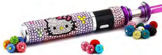
Figure 3: E-cigarette products and accessories.

The use of cartoon characters in advertising and promoting of e-cigarettes as fashion accessories are other ways these products appeal to youth with the implication that these products are harmless (see Figure 3). E-cigarette manufacturers report sponsoring concerts, sporting events, and parties that include the distribution of free samples; many of these events occurred in California. 32 Another tactic to create a perception that e-cigarettes are family friendly is through the association of these products with family oriented attractions.